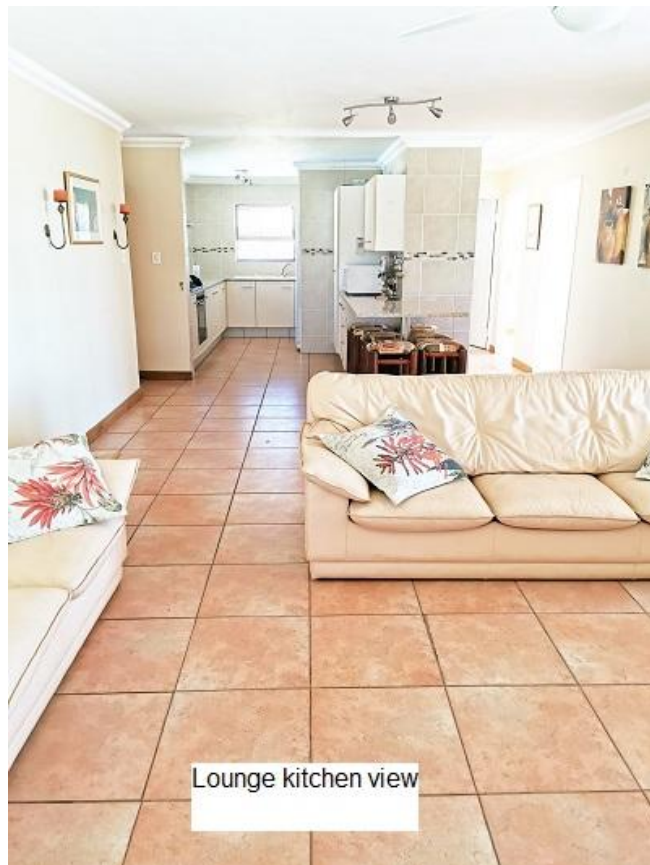
Lounge kitchen view