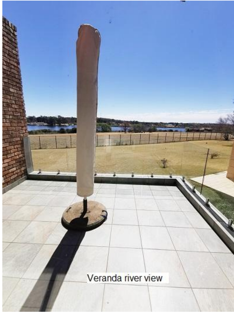
Veranda river view