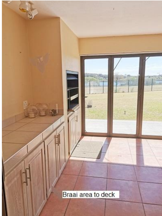
Braai area to deck