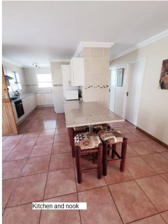
Kitchen and nook