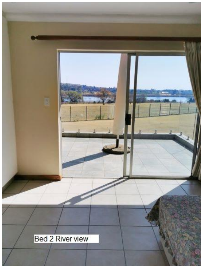
Bed 2 River view