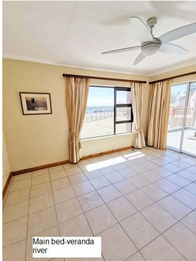
Main bed-veranda river