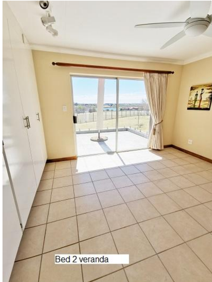
Bed 2 veranda