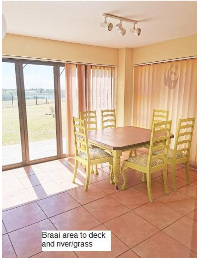
Braai area to deck and river/grass