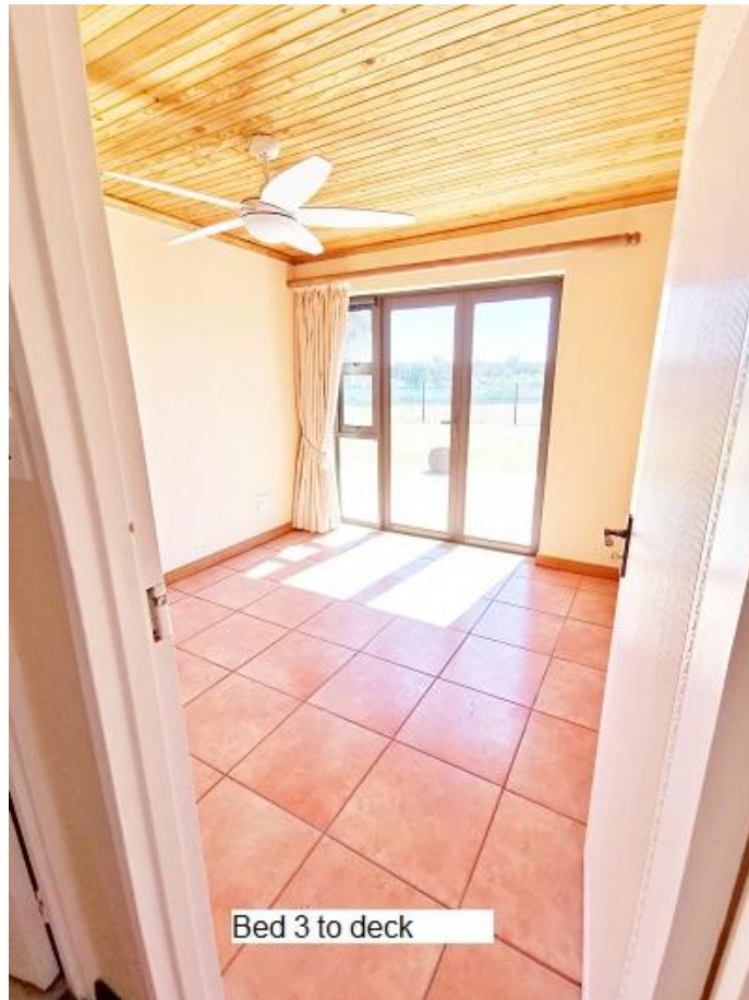
Bed 3 to deck