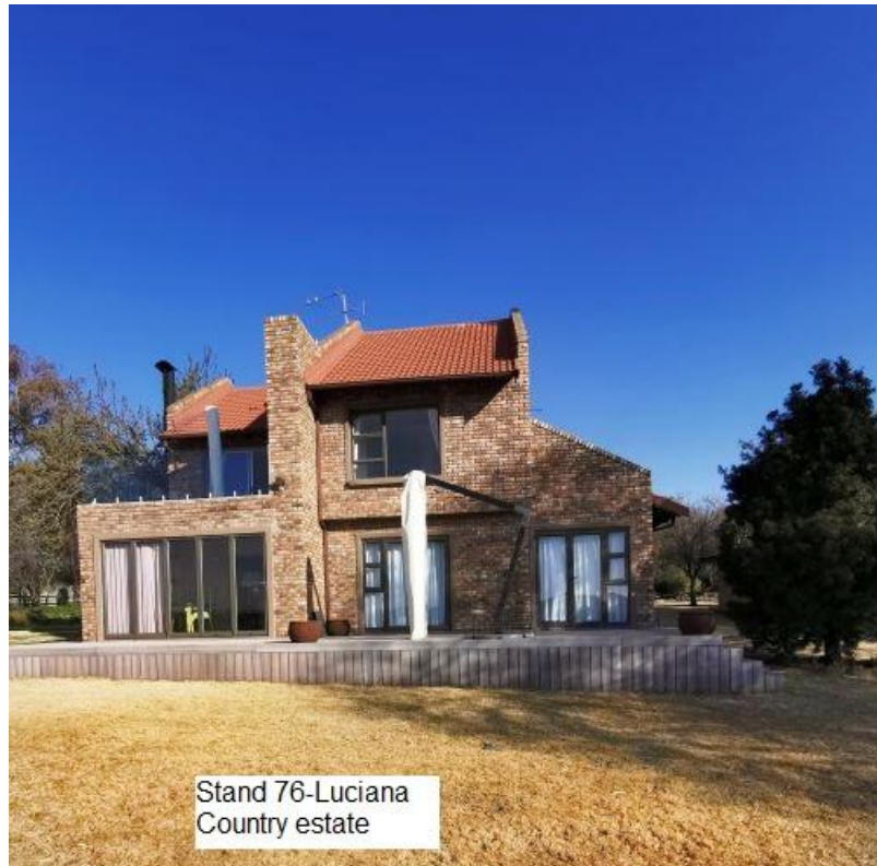
Stand 76-Luciana Country estate