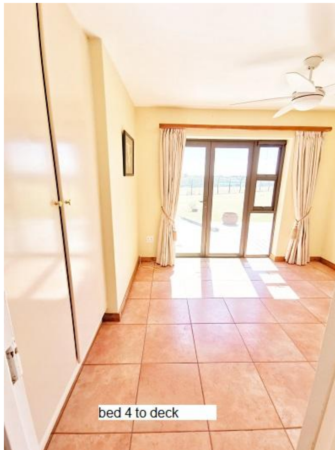
bed 4 to deck